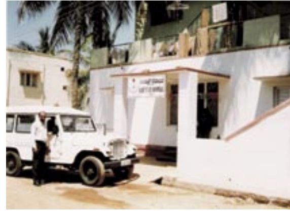
The hospital in Hoskote where it all started

Our dream was finally realized and the new building was inaugurated in 2005. It has a built up area of 14,000 sq ft with a free service section, complete with OPD, 3 Operating Theatres, Wards and a Canteen and a good paying section. The hospital has an excellent team of dedicated ophthalmologists and staff.