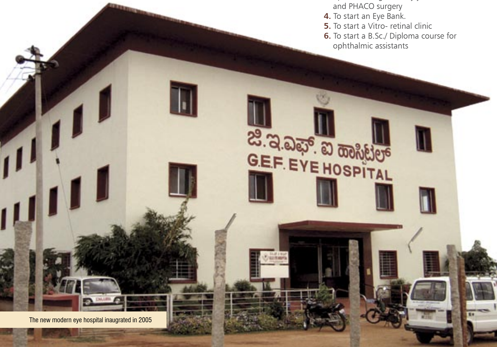
The new modern eye hospital inaugurated in 2005